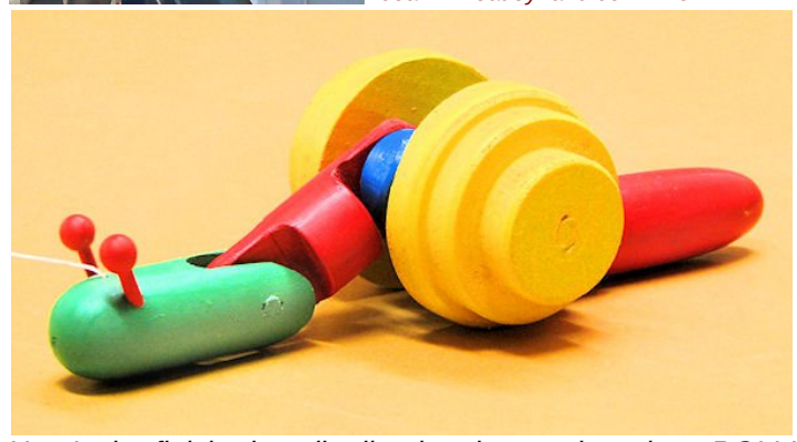
Here's the finished snail, all painted up and ready to ROLL! The backgrounds and interests of fellow members