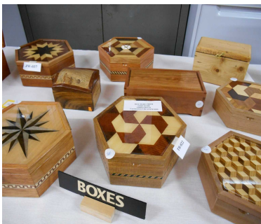
Some of Rob Donker's fine Jewellery Box entries in last month's BE-IN_IT competition.

After I have made the panel up I simply press it into the base of the box, by cutting the board 1mm undersize and wrapping the fabric around the edges of the board there is enough give to hold the board tight relying on friction only, the result is a professional looking job that will sell if you want to. ....Phil