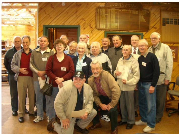
Flashback (2009):members proudly showing BE-IN-IT awards