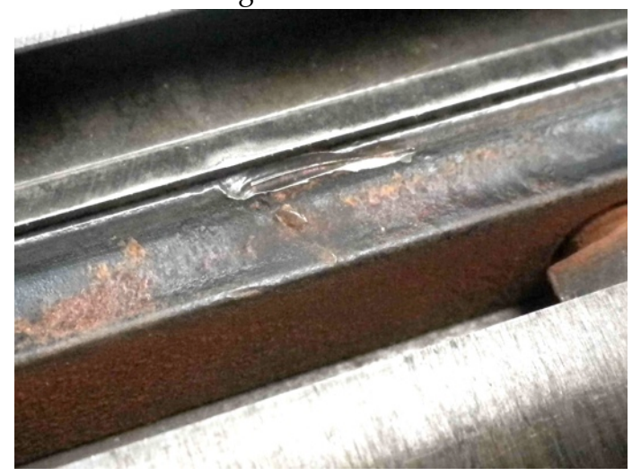
PLEASE USE THE METAL DETECTOR and VISUALLY INSPECT all timber before passing it through ANY OF THE MACHINES!

We continue to experience few problems with the thicknesser . However, some talented individual has managed to mutilate the blades of the jointer by passing what appears to be a screw-head through the machine.