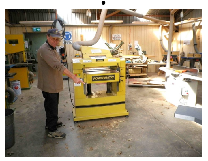
This is yet another plea for Members to CLEAN UP YOUR OWN MESS! These photos were