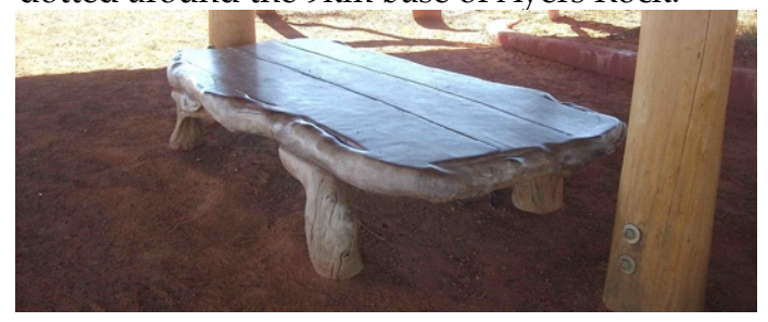
They're brilliant for a woody way out of town! ..... (Gaz, Caravanning July 2011, NT).

base seat is one huge 2 1/2" thick slab, over 6 foot long! We had four us sitting in one with no worries at one spot. I tell you, walking around the wonderful rock formations of the MacDonnell Ranges, Kings Canyon and Ayers Rock / The Olgas - you really appreciate reaching a comfy seat to catch your breath again. You've got to hand it to the group that got these made.I'm yet to research the makers - but there are tables, many 4-person chairs dotted around the 9km base of Ayers Rock.