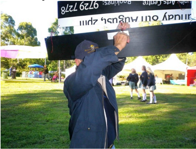
Guess the Club Member! No prize other than the satisfaction of demonstrating your powers of observation. Answer in next month's issue.