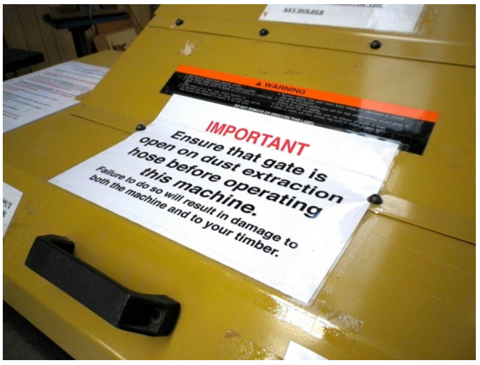
I am also including a photograph of the gate, which needs to be open AT ALL TIMES that the thicknesser is in use.

A reminder to open the dust extraction gate has also been added to the top of the thicknesser, as shown below.