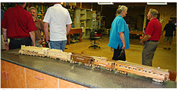
5 pieces) of the train assembly as seen in the photo.

This month Charles surprised us all by bringing the rest (all