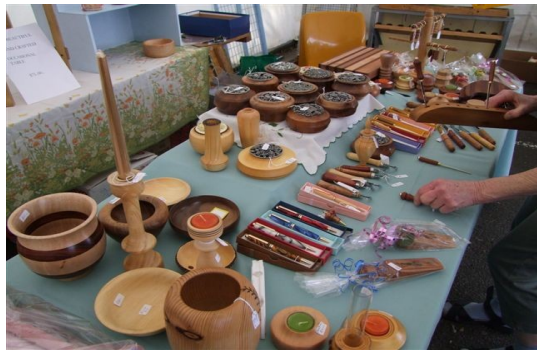
On sale to the public – Member's skills on display