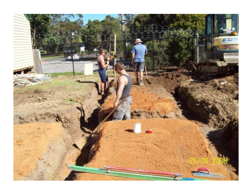
Men at Work!