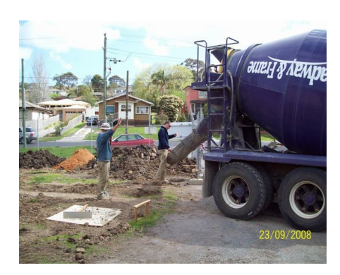
Pouring the Foundations