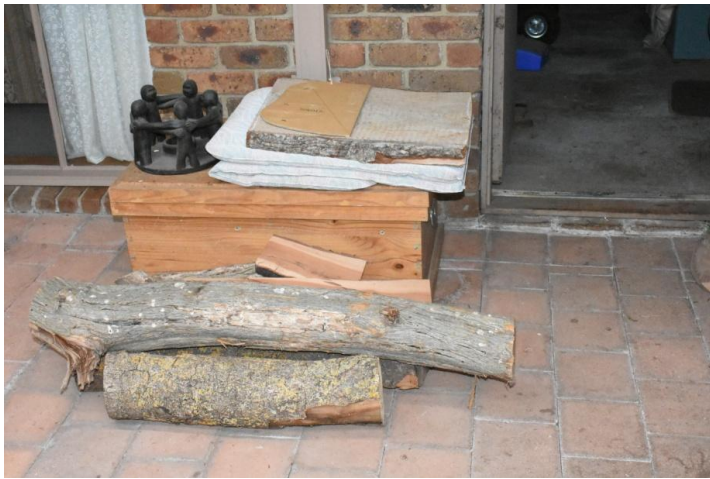
Figure 1: The Windsor chair flat pack chair kit

Making the chair presented several challenges for me, things that I had either not tried before or a level of work that put me outside my comfort zone, like steam bending wood and drilling all the compound angled holes in the seat and bows.