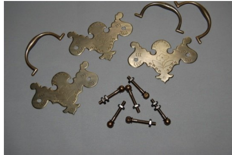
Figure 1 Brass ware

I also wanted to use standard sized dressed timber that was readily available so I chose Red Oak which I found my local Masters store stocked. My reason for standard readily available timber was to show that one did not need a workshop full of machinery and tooling to make nice furniture. I could not find suitable draw pulls in Australia so I ordered the draw pulls on line from Horton Brass in the US (http://www.horton-brasses.com/).