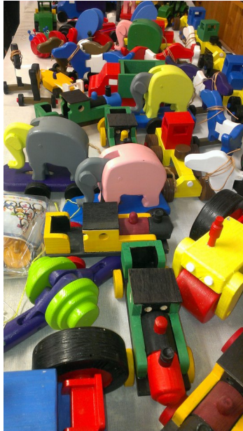
Congratulations and a BIG XMAS THANKYOU to all the members, and the Toy Group who managed to create this terrific array of toys this year