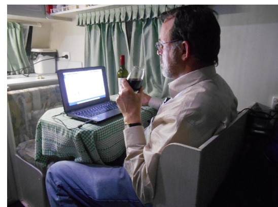
(PS:The local wines in the area aren't too bad either!)