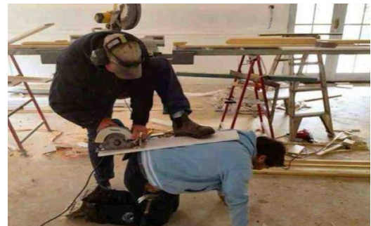
The bloke kneeling is not wearing ear protection or safety glasses!!

My Fear is that when I die my wife will sell my woodturning tools for what I said I paid for them