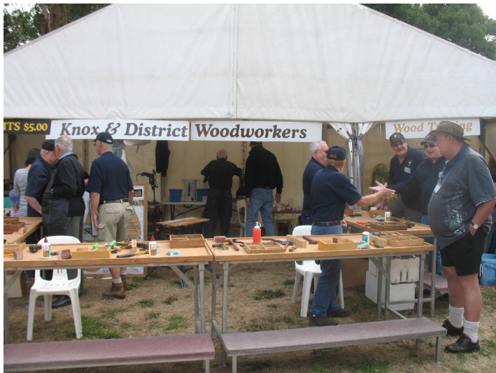
This is the tent. Lucky no rain!