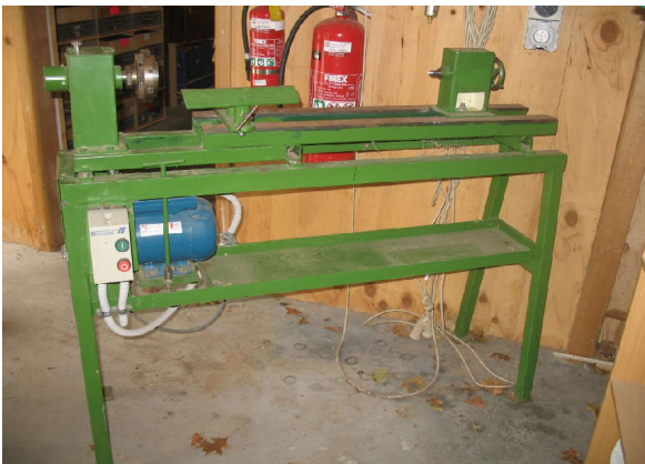
Item can be inspected in wood store. Offers accepted above $150

The following item (with reserve prices stated) available for sale by TENDER SUBMISSION to the committee.