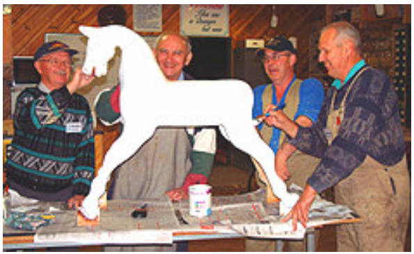
Rocking Horse Group Ramblings

A group of the rocking horse team having fun applying filler to the latest rocking horse being made for the Club. They are particularly happy as the painting is the last job before adding the trimmings so the horse is being completed on time.