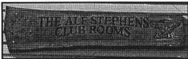
The Clubrooms will now be known as The Alf Stephens Clubrooms