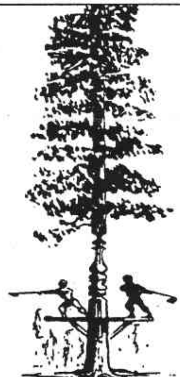
Bidelonian woodturners hard at work on a traditional lamp base. (Sorry traditional street lamp base)